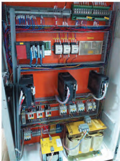
3-AXIS SERVO MOTION CONTROL PANEL