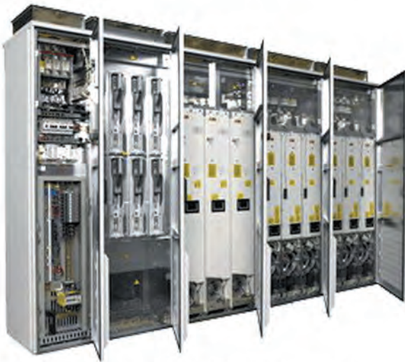
MULTI DRIVE CONTROL PANEL

Adjustment of Speed of the Motor in an application, which is required in all the process industries & Machine Manufacturers, Variable frequency drive is used as energy saving device. For some of the Machines to save power or it is used as final control element of the closed loop application where the speed of the Motor is changed to control one Parameter.